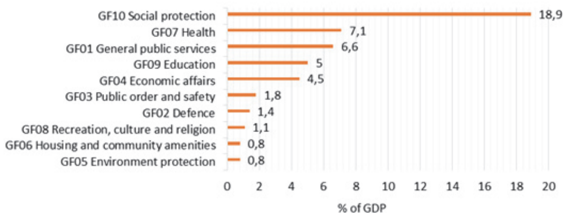
Figure 1. Social protection in the structure of general government expenditure (COFOG) in EU28, the average of 2007-2016

Source: Author based on Eurostat (2018).